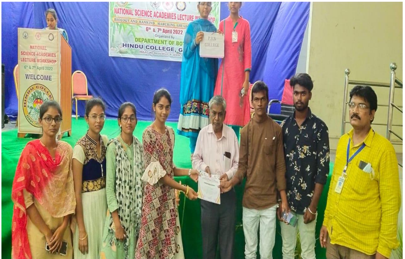
Giving Certificates to the Participants