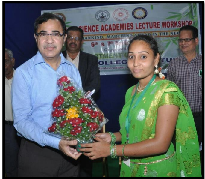
Nalini Mohan Denduluri - IFS Cheif Guest honoured with a bouquet