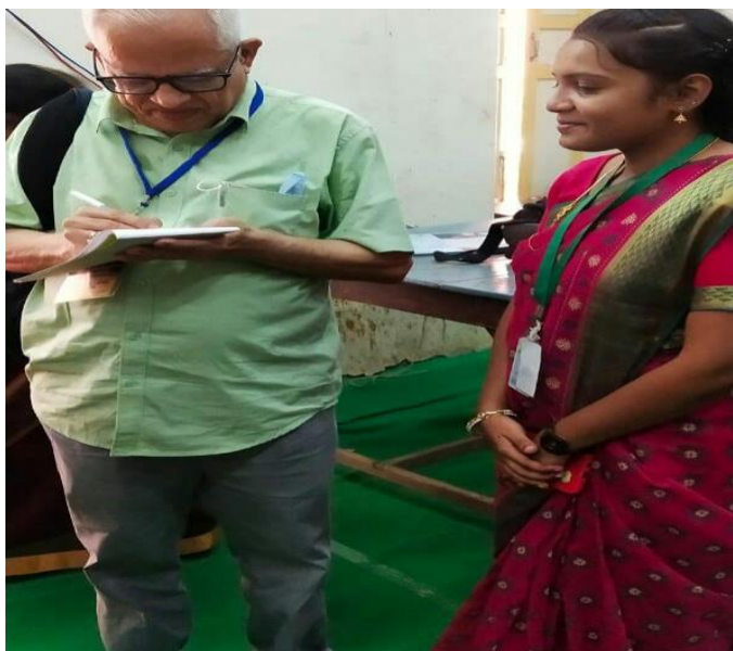
Student's Interaction with Resource Person