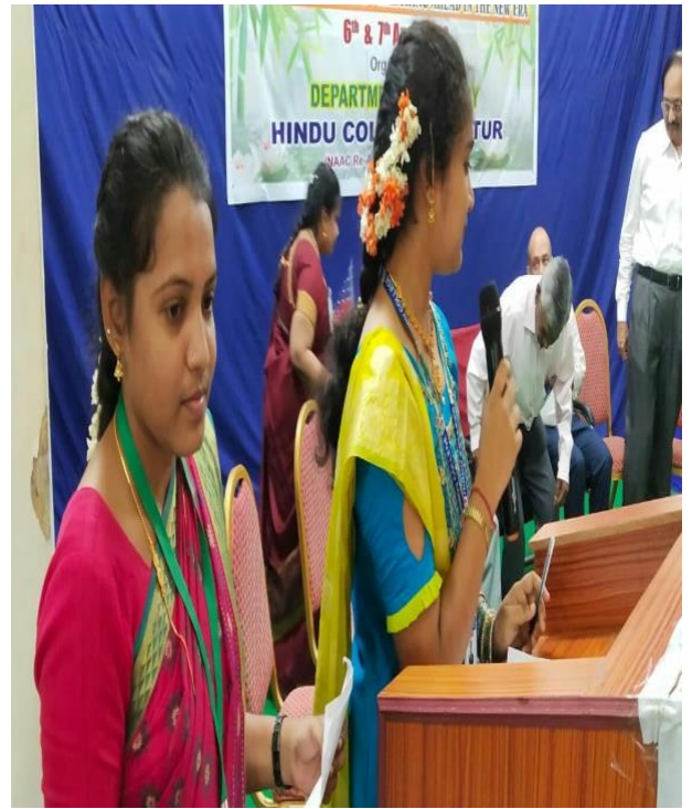
Feed back from Students