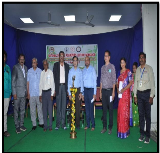
Lighting of the lamp