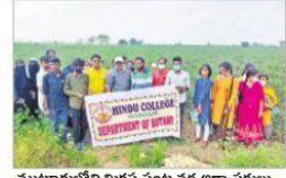
ముట్లూరులోని మిరప పంట వద్ద అధ్యాపకులు, విద్యార్థులు