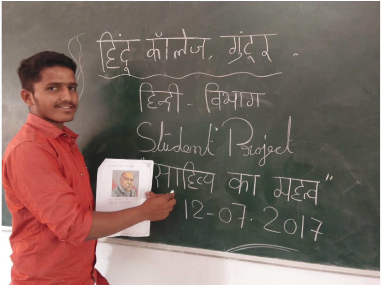
Head of the Department