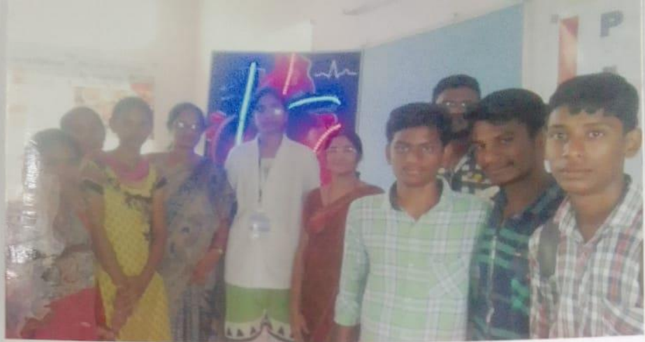
Awareness on Cardiac Attack at Katuri Medical College on 14-12-20