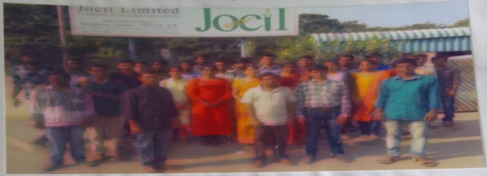
Field trip to Joci