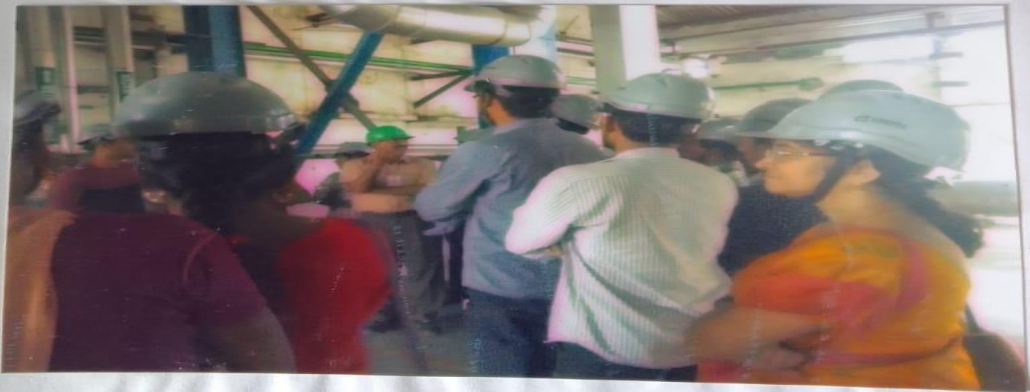
Field trip to Joci 17-18